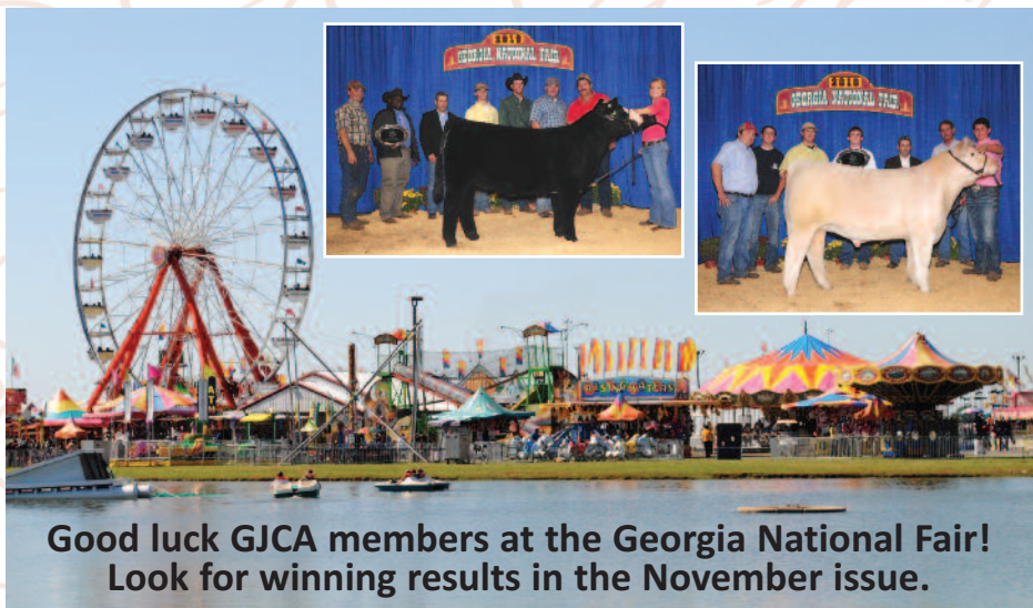
Good luck GJCA members at the Georgia National Fair! Look for winning results in the November issue.